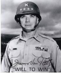
Commanding General, Eighth U.S. Army Korean War, 1951-1953