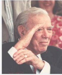
Saluting Two Medal of Honor Recipients at His Birthday Party in 1992, Age 100