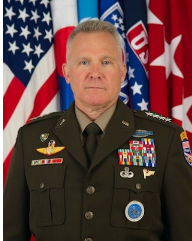
Commander UNC/CFC/USFK Gen. Paul J. LaCamera

General Paul J. LaCamera assumed command of United Nations Command, ROK-U.S. Combined Forces Command, and United States Forces Korea (UNC/CFC/USFK) on July 2, 2021.