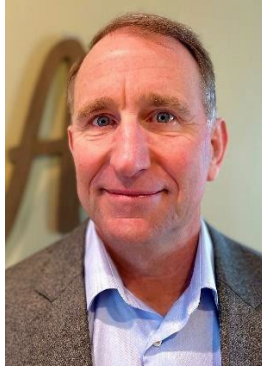
ROBERT B. "ABE" ABRAMS GENERAL (R), US ARMY

Retired from active duty on 31 August 2021 with over 39 years of service. An Armored Cavalryman, General Abrams earned his commission from the United States Military Academy in 1982. Following the Armor officer basic course, he spent his formative years in a Division Cavalry Squadron with a mission on the East-West German border. He commanded at every level from Company thru Four Star Major Command, and led units in combat operations in Saudi Arabia, Kuwait, Iraq and Afghanistan. He also commanded the Army's National Training Center at Fort Irwin, California and later served as the Senior Military Assistant to the 24th Secretary of Defense.